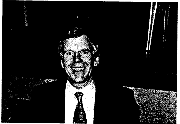
Jeremy Bulloch (Boba Fett)